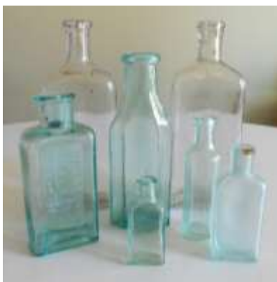
Vintage Vases $2.00 each (various styles and sizes)