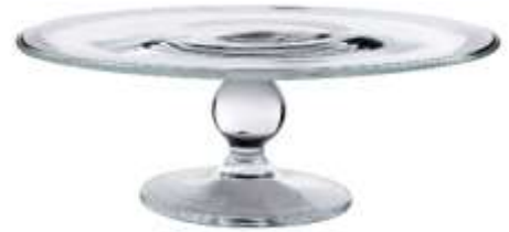
Glass Cake Plate $10.00