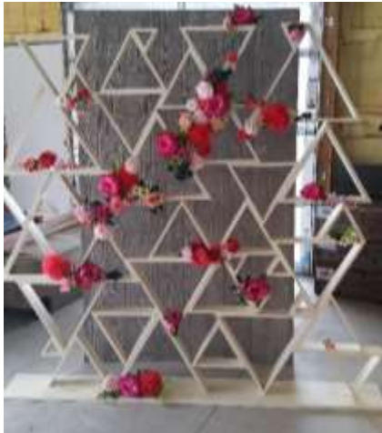
Geometric Backdrop $130.00 each