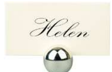
Place card/table number/cake flavor holder $1.50 each

To reserve your rentals, email YourPerfectDayLLC@gmail.com or call 419.283.8200 Pricing is self-set up and tear down. $90/hour fee for Your Perfect Day to deliver, set up and tear down.