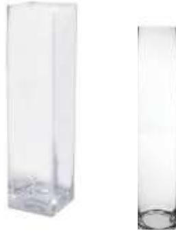
20" Square or Cylinder Vase $9.00 each (3" wide)