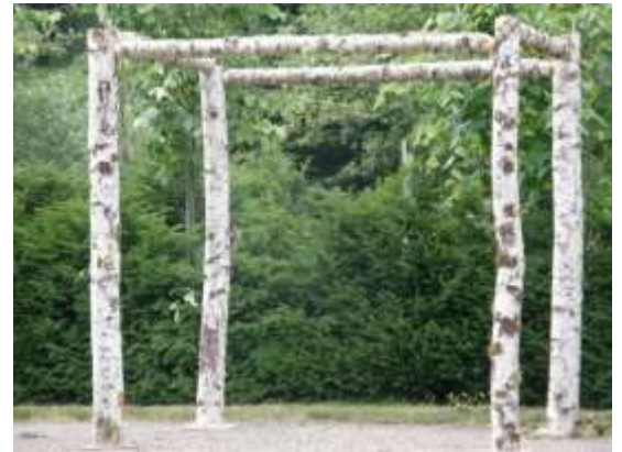
White Birch Chuppah $175.00 each