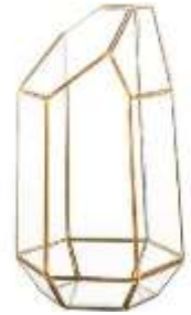
Tall Geometric Gold Terrarium