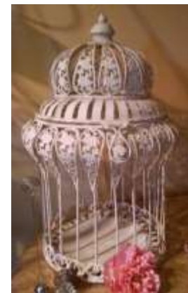
Ivory Bird Cage (card holder) $16.50

To reserve your rentals, email YourPerfectDayLLC@gmail.com or call 419.283.8200 Pricing is self-set up and tear down. $90/hour fee for Your Perfect Day to deliver, set up and tear down.