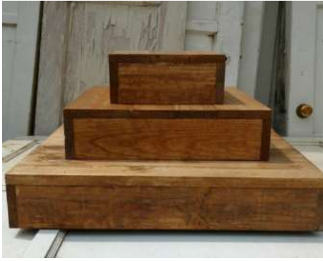
Wooden Cake/Cupcake Stand $18.00 each (2 or 3 tier available)