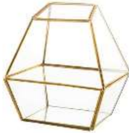
Geometric Gold Terrarium