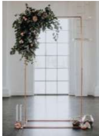
Copper Pipe Arch $145.00 each