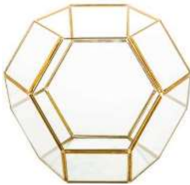
Geometric Sphere Gold Terrarium