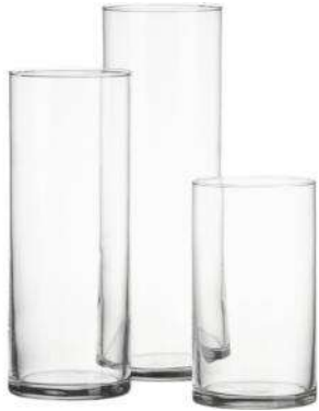
Cylinder Vases $1.75 each (5", 7", 9" or 11" tall - 3" wide)

Your Perfect Day — PLANNING • DECOR • FLORAL —