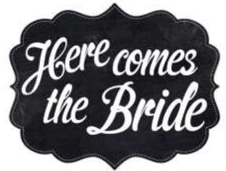
"Here comes the Bride" sign