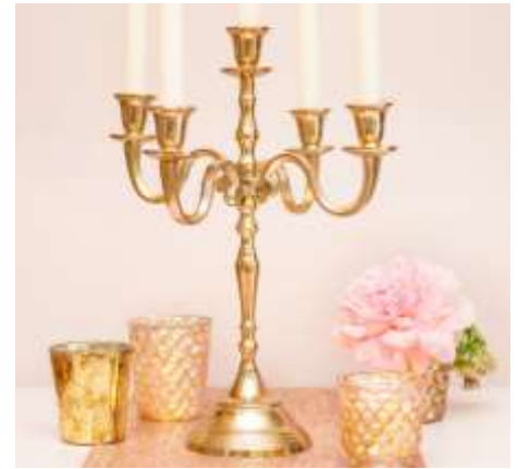
15" Metal Candelabra - Gold $18.50 each ($4.00 per battery-operated taper candle)