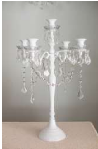
24" White Candelabra $28.00 each ($4.00 per battery-operated taper candle)