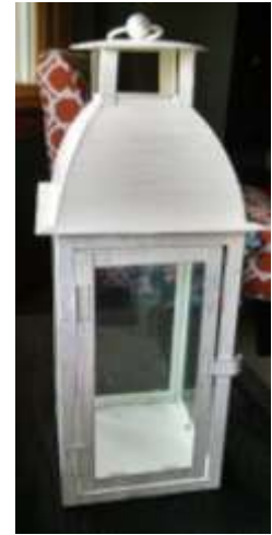
10" Ivory Lantern $7.50 each ($4.00 extra for real /fake " "