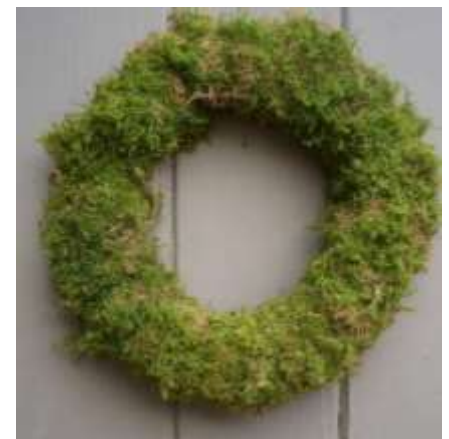
18" Moss Ring