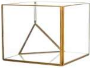
Geometric Square Gold Terrarium