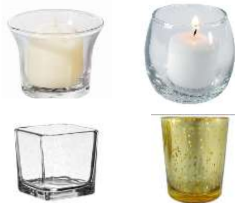
Circle, Square, Flip, Gold or Silver votive $1.05 cents each with 8-hour candle