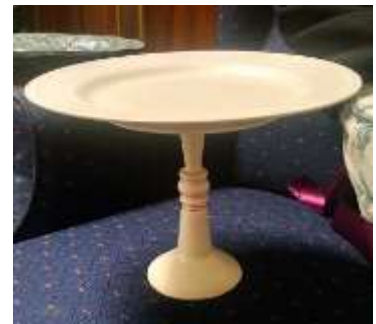
Pie Plates $6.00 each

To reserve your rentals, email YourPerfectDayLLC@gmail.com or call 419.283.8200 Pricing is self-set up and tear down. $90/hour fee for Your Perfect Day to deliver, set up and tear down.