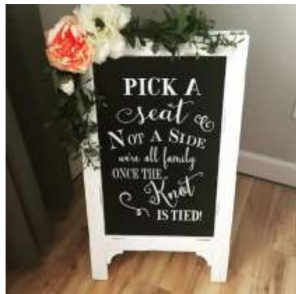
Double sided chalkboard sign