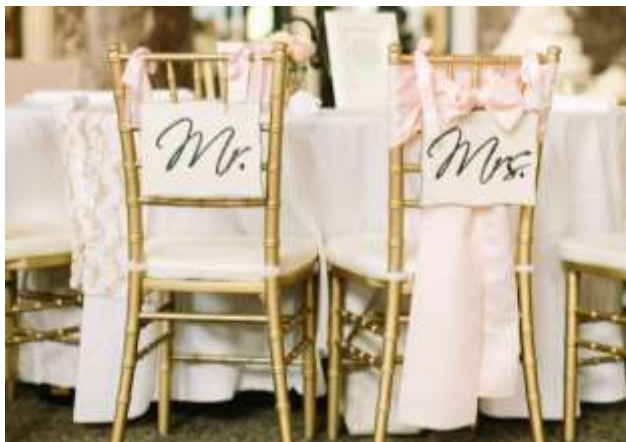
Mr. & Mrs. signs $3.50 each