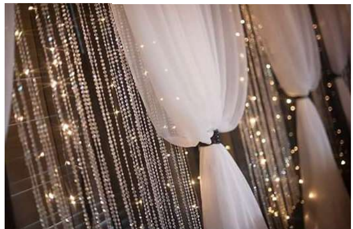
6' crystal curtains $27.50 each