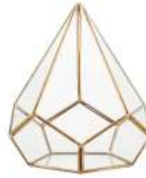
Geometric Triangle Gold Terrarium