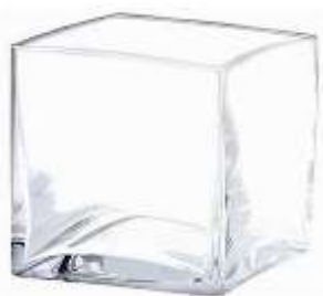
6" Square Vase - $5.00 each 3" Square Vase - $2.00 each