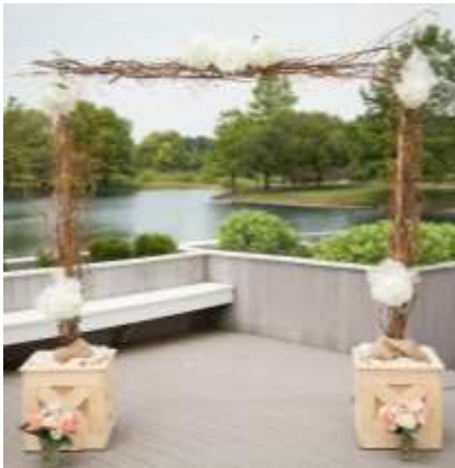
Willow Branch Arch $115.00 each