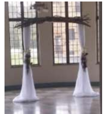
Wood/Fabric Arch $125.00 each

To reserve your rentals, email YourPerfectDayLLC@gmail.com or call 419.283.8200 Pricing is self-set up and tear down. $90/hour fee for Your Perfect Day to deliver, set up and tear down.