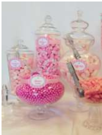
Popcorn/Candy Jars $7.50 each (includes metal scoop)