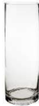
3' and 4' Cylinder Vase (6" wide) $15.00 each