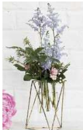
Metal Vector Geometric Diamond Vase 4.5" x 5.25" x 7" $5.50 each