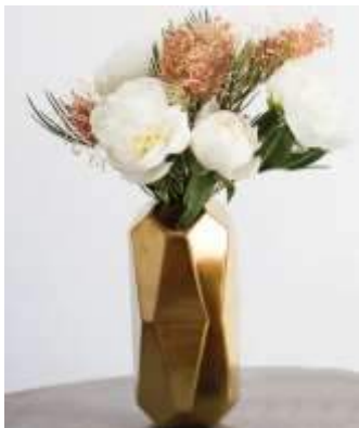
Ceramic Geometric Vase 4.5" x 8.5" $7.50 each