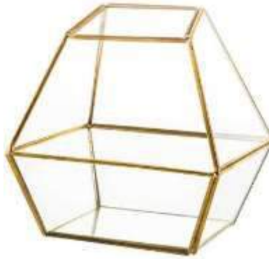
Geometric Gold Terrarium 5" wide X 5" tall $8.50 each