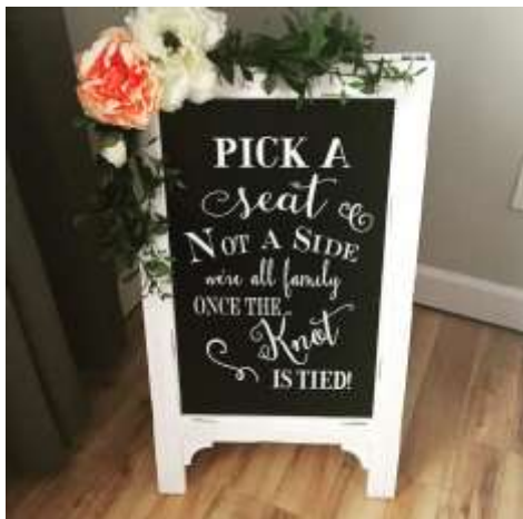
Double sided chalkboard sign $12.50 each (custom writing is extra)