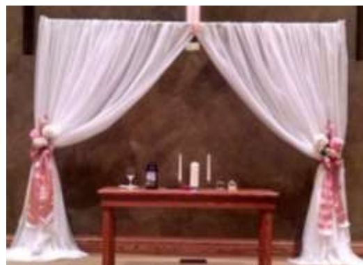
Fabric Arch $95.00 each