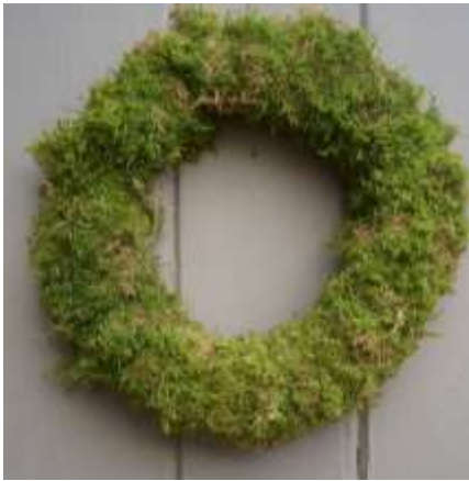
18" moss ring $14.50 each