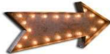
LOVE, BAR, "HEART" or ARROW LED Signs $18.00 each