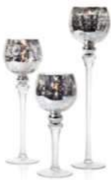
Mercury Vases $4.00-$8.00 each (6" – 12" tall)