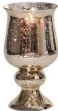
8 ¾" Mercury Vase $8.00 each