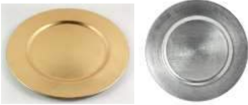
12" Gold & Silver Charger Plates $2.00 each