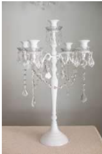
24" White Candelabra $28.00 each ($4.00 per battery-operated taper candle)