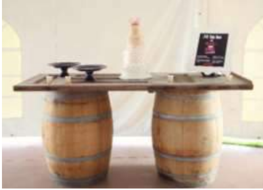
Wine Barrel $55.00 each