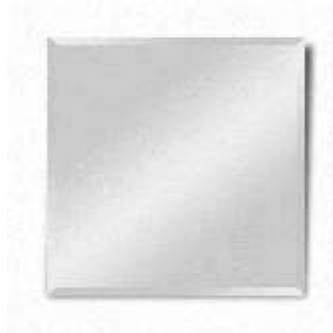
12" Square Mirror $1.50 each