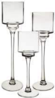
10", 12", 14" Floating Candle Holders $6.50 each (votive/floating candles are extra)