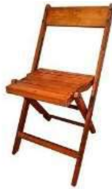
Natural Wood Folding Chair $1.95 each