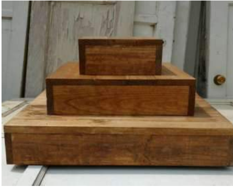
Wooden Cake/Cupcake Stand $18.00 each (2 or 3 tier available)