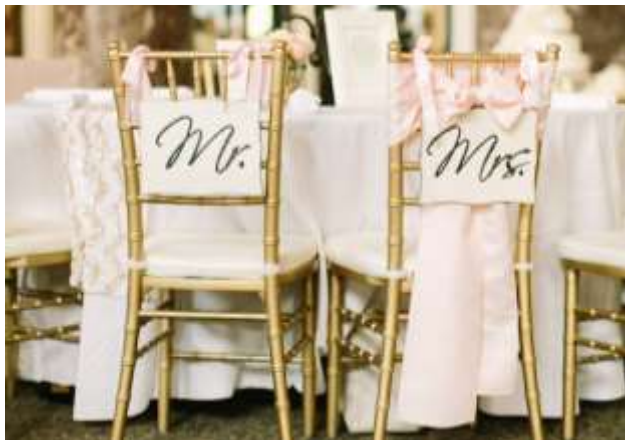
Mr. & Mrs. signs $3.00 each