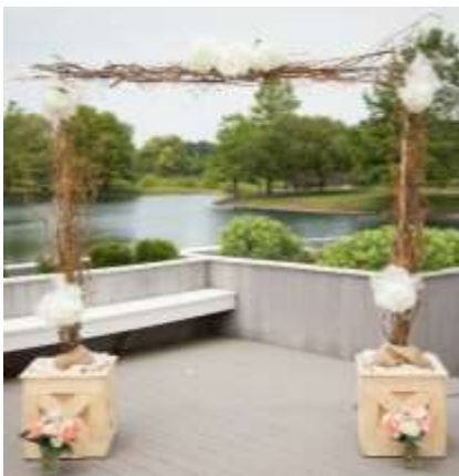
Willow Branch Arch $115.00 each