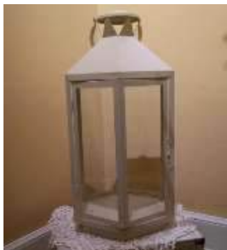
Lantern card box $15.00 each