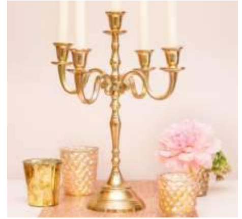
15" Metal Candelabra - Gold $18.00 each ($4.00 per battery-operated taper candle)