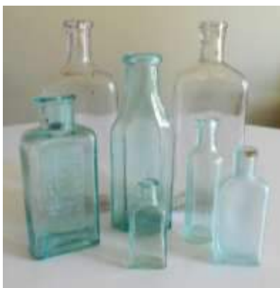
Vintage Vases $2.00 each (various styles and sizes)