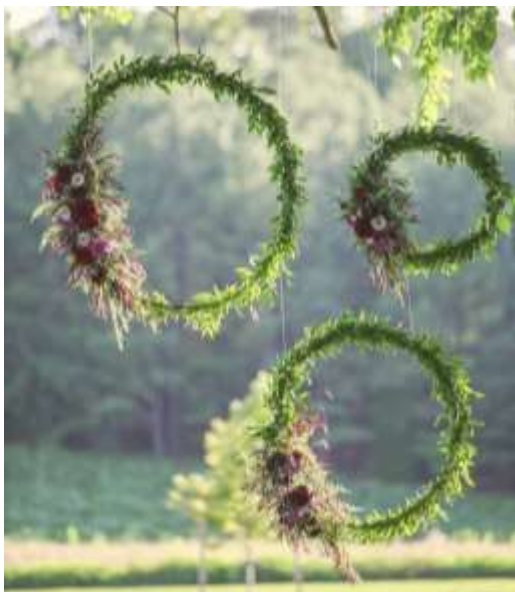
Customized floral wreath