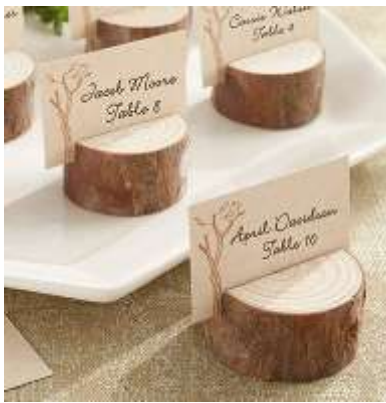
2" Wood Slice Table # holder $1.50 each