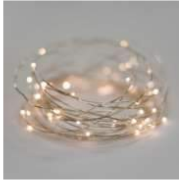
Fairy Lights $3.50- $8.50 each (2' strand or 8' strand)