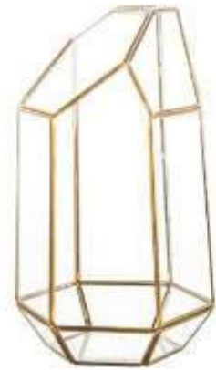
Geometric Gold Terrarium 5" wide X 9" tall $11.50 each