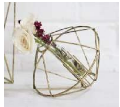
Metal Vector Geometric Diamond Vase 6" x 5.25" $5.50 each

To reserve your rentals, email YourPerfectDayLLC@gmail.com or call 419.283.8200 Pricing is self-set up and tear down. $90/hour fee for Your Perfect Day to deliver, set up and tear down.