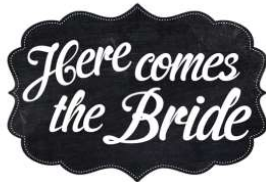
"Here comes the Bride" sign 8" tall X 11" wide $5.00 each