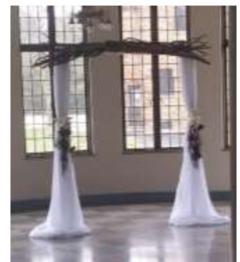
Wood/Fabric Arch $125.00 each