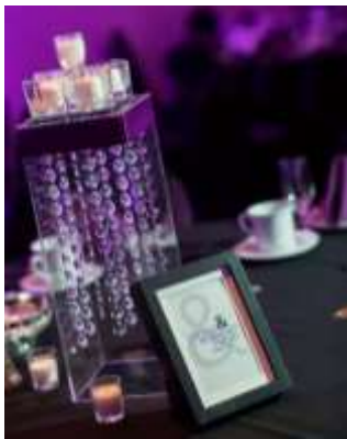
14" X 4" Plexiglass box $14.50 each (Includes 8 hanging crystals)