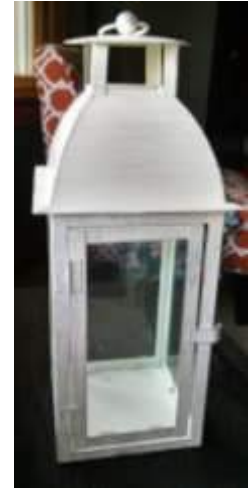
10" Ivory Lantern $7.50 each ($4.00 extra for real /fake