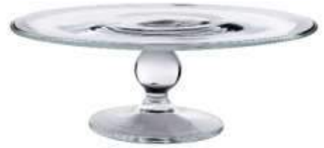
Glass Cake Plate $10.00