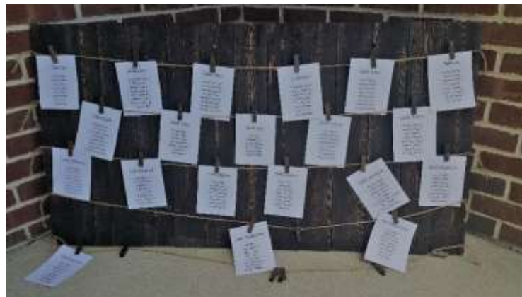
24" W X 48" Wooden Board $24.00 (includes 5 lines of twine and 30 clips)