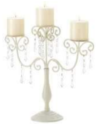
12" Ivory or Black Candelabra $12.00 each