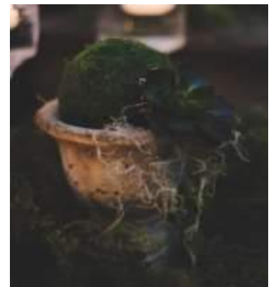
Clay pots/planters $4.00-$12.00 each (various sizes)