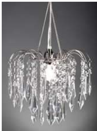
Tiered Crystal Chandelier 13" wide X 11" tall $25.00 each