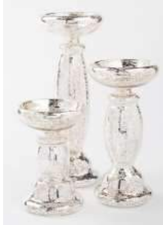
Silver candle holders $3.00-$6.00 each (4" – 8" tall)