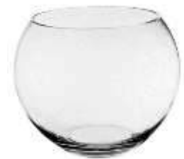
6" Round Vase - $4.50 each 4" Round Vase - $3.50 each 3" Round Vase - $2.50 each