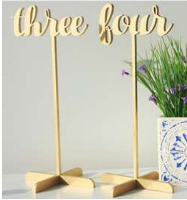
Gold Table Numbers (1-30) $4.50 each