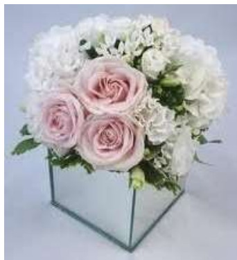
Mirrored Cube Vase $4.00 - $8.00 each (various sizes)