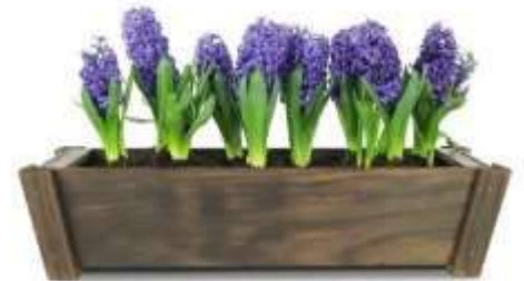
24" X 7" Planter Box $12.00 each

To reserve your rentals, email YourPerfectDayLLC@gmail.com or call 419.283.8200 Pricing is self-set up and tear down. $90/hour fee for Your Perfect Day to deliver, set up and tear down.