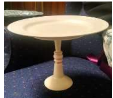
Pie Plates $6.00 each

To reserve your rentals, email YourPerfectDayLLC@gmail.com or call 419.283.8200 Pricing is self-set up and tear down. $90/hour fee for Your Perfect Day to deliver, set up and tear down.