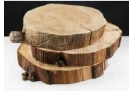
12" Preserved Wood Slab $3.50 each