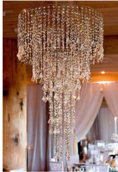
Tiered Crystal Chandelier $95.00 each (for $50 per piece)