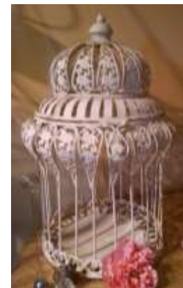
Ivory Bird Cage (card holder) $15.00

To reserve your rentals, email YourPerfectDayLLC@gmail.com or call 419.283.8200 Pricing is self-set up and tear down. $90/hour fee for Your Perfect Day to deliver, set up and tear down.