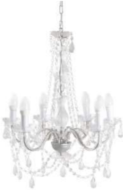
Crystal Chandelier with lights $105.00 each