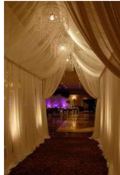
10' Fabric Hallway $285.00 each (includes 2 chandeliers)