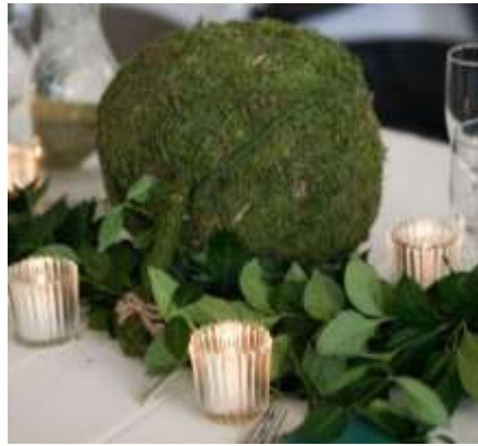
2", 4" and 6" moss ball $1.50-$3.50 each