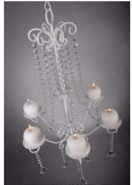
Vintage Chandelier $40.00 each (add candles or flowers)