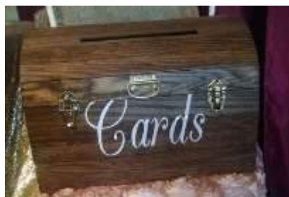
Wooden Card Box $25.00 each