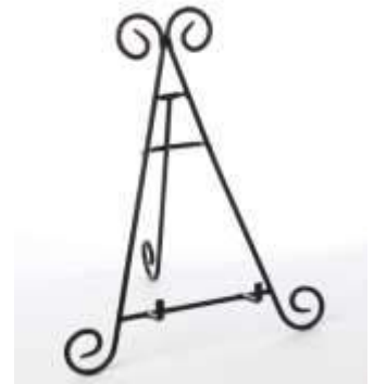
Metal Easel $5.00 - $15.00 each (various styles/heights)