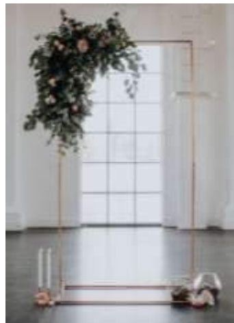
Copper Pipe Arch $145.00 each