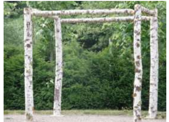
White Birch Chuppah $175.00 each