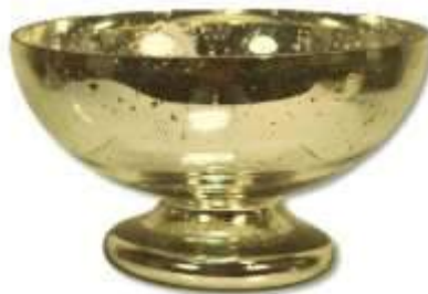
Gold Mercury Vase $8.50 each (7" wide X 5" tall)