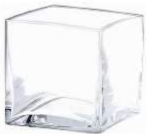
6" Square Vase - $5.00 each 3" Square Vase - $2.00 each