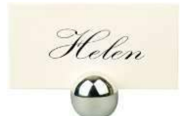
Place card/table number/cake flavor holder $1.50 each

To reserve your rentals, email YourPerfectDayLLC@gmail.com or call 419.283.8200 Pricing is self-set up and tear down. $90/hour fee for Your Perfect Day to deliver, set up and tear down.