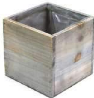
6" Wooden Cube $6.00 each