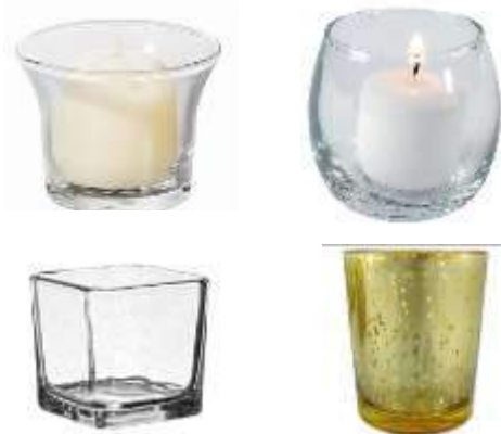
Circle, Square, Flip, Gold or Silver votive $1.05 cents each with 8-hour candle